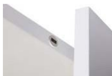
back edge of door